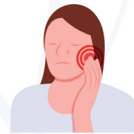
Pain or tenderness while chewing